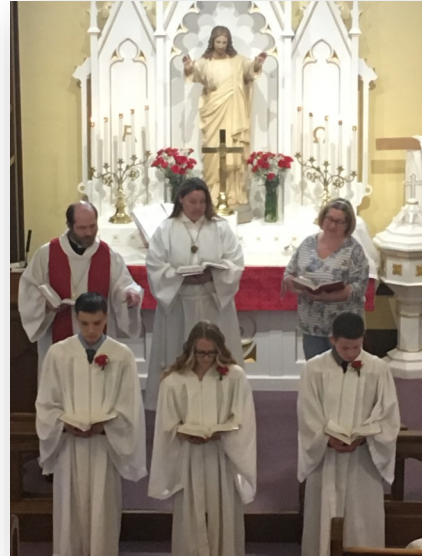
2019 Confirmation Sunday, May 5, 2019